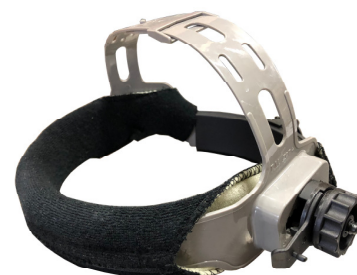
5-Point Adjustable Head Gear